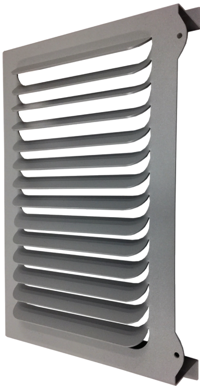
Louvered Filter Frame

These deeper filter frames can easily be retrofitted on existing units with standard filters.